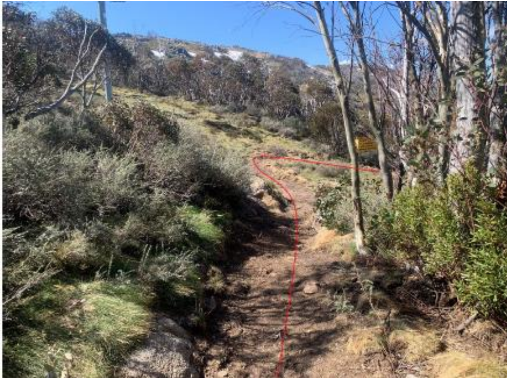
Figure 3 | Photo point 4: the proposed trail alignment utilising a section of the former LAM trail alignment.