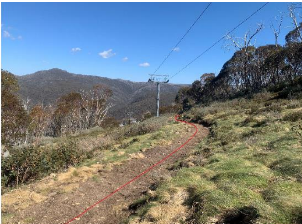
Figure 4 | Photo point 5: the proposed trail alignment descending down a section of the former LAM trail alignment below the Cruiser chairlift.