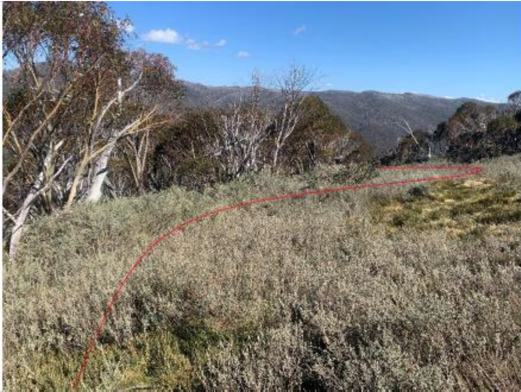
Figure 5 | Photo point 6: the proposed trail alignment traversing the Playground ski run.

The estimated cost of works for the proposal is $31,537.00.