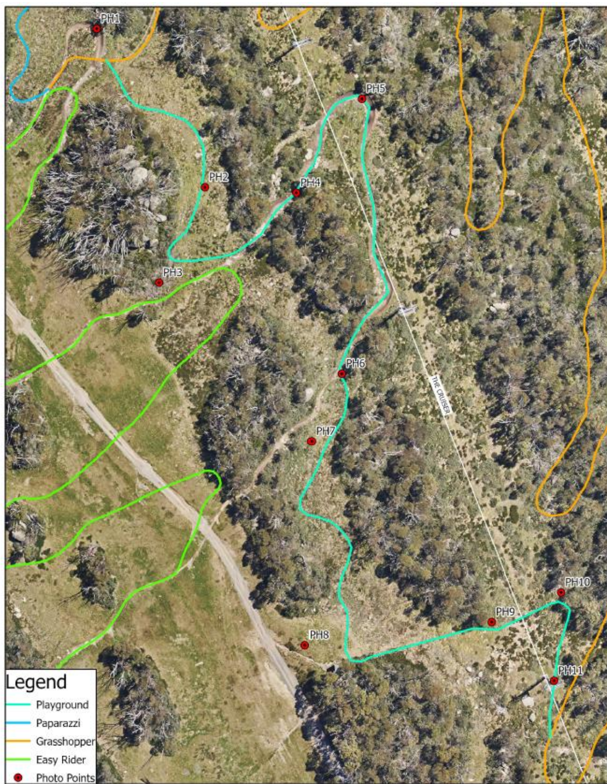
Figure 2 | Photo points of the proposed trail alignment